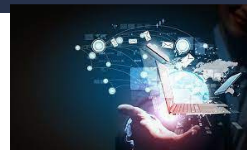
Online One Week FDP on "Communication and ICT"

Online One Week FDP "Linux Ubuntu opreating System Date: 15 To 20 April 2020