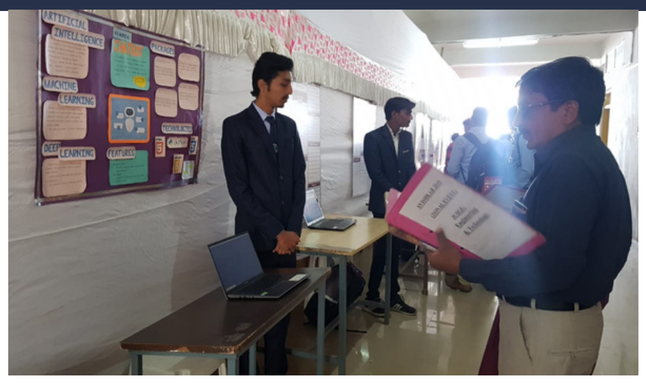
Ty CSE Students got first prize In DBATU Xonal Avishkar in engg and tech section poster