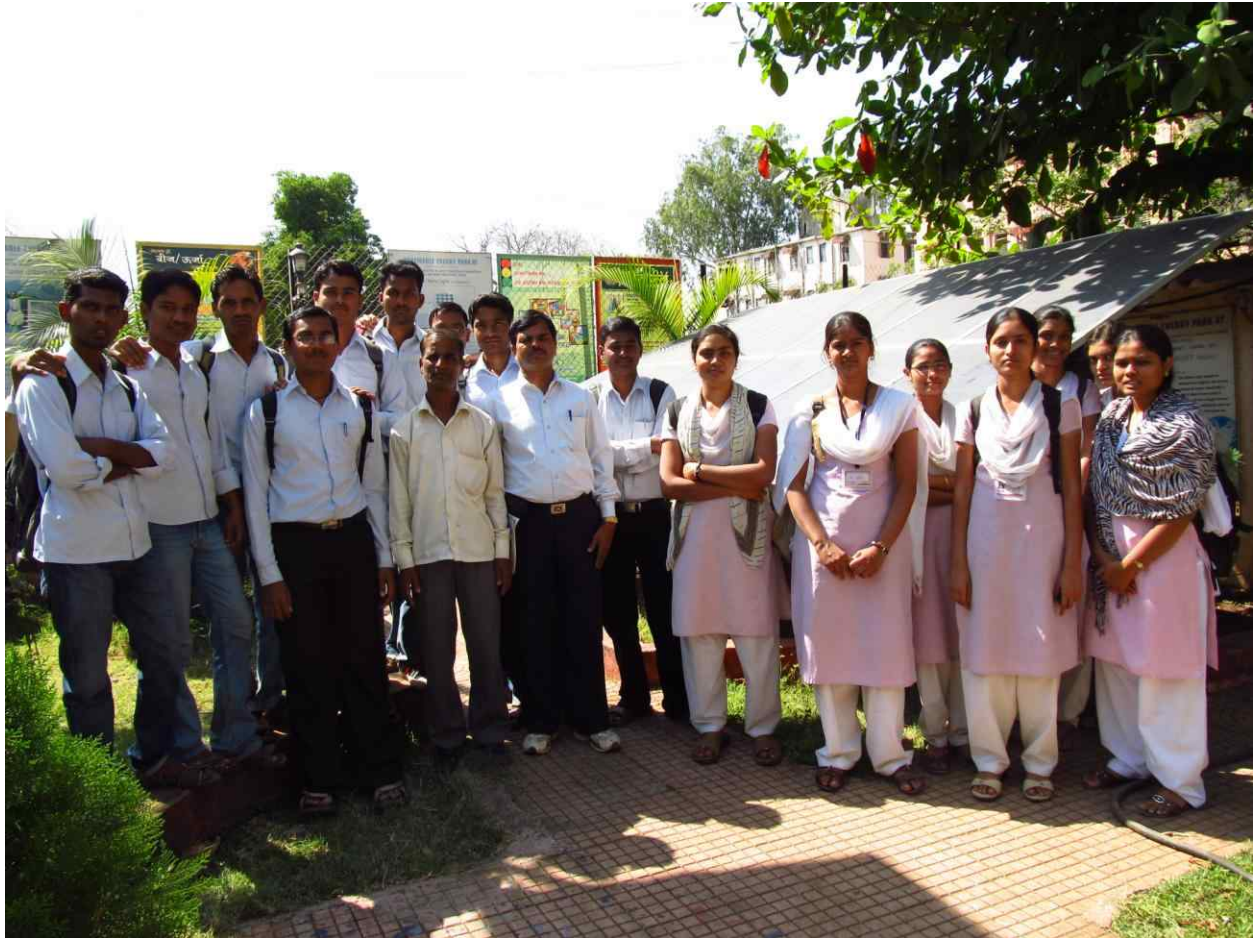
Industrial visit to Suzlon Wind mill Pvt Ltd Chalkewadi on 28/03/2013