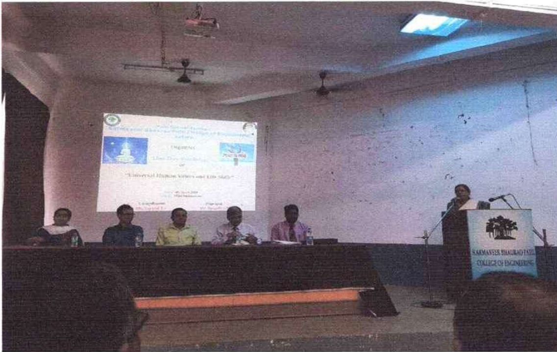
Inauguration of One Day Workshop on “Universal Human Values and Life Skills” On 30/04/2018