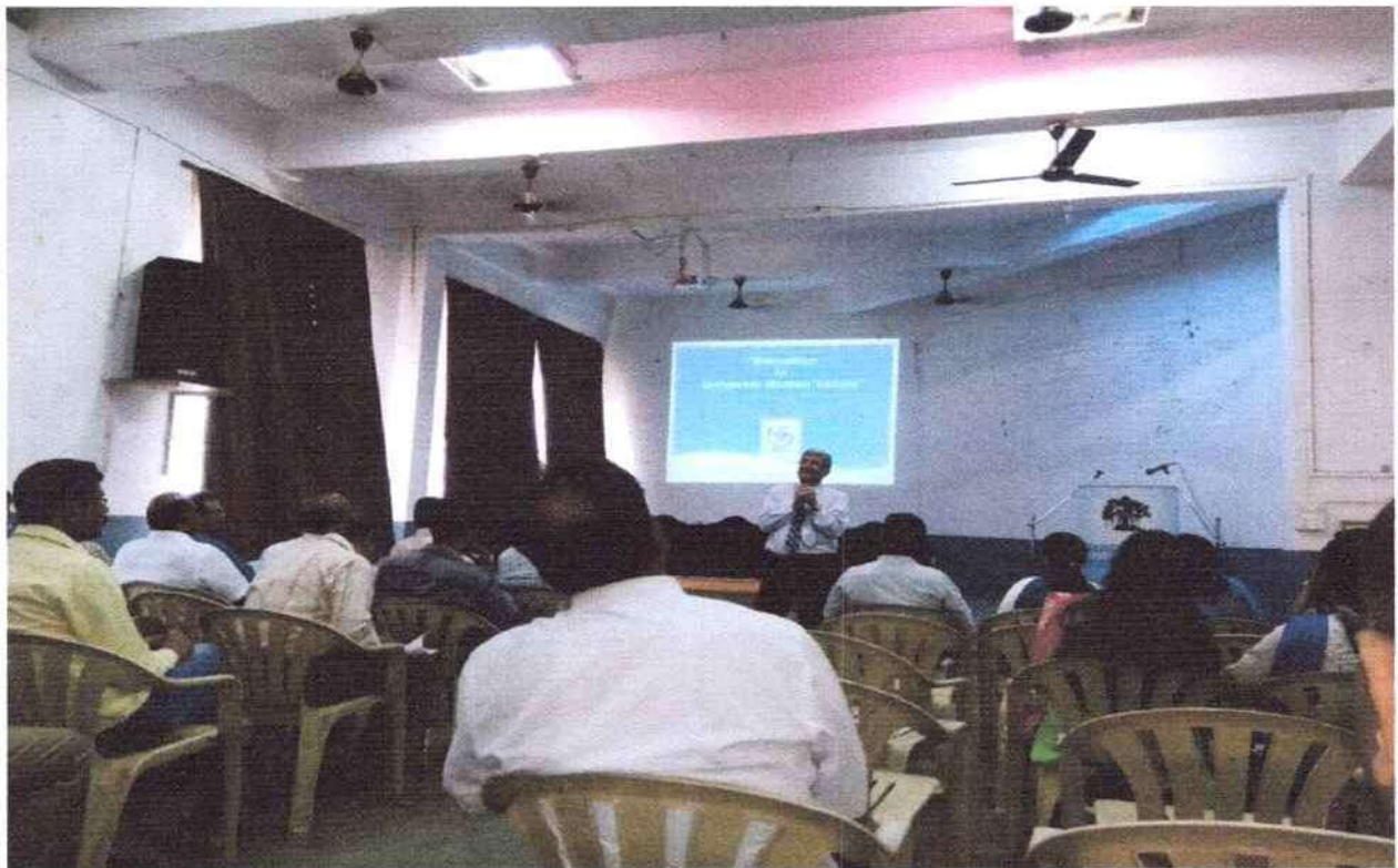
One Day Workshop on “Universal Human Values and Life Skills” On 30/04/2018