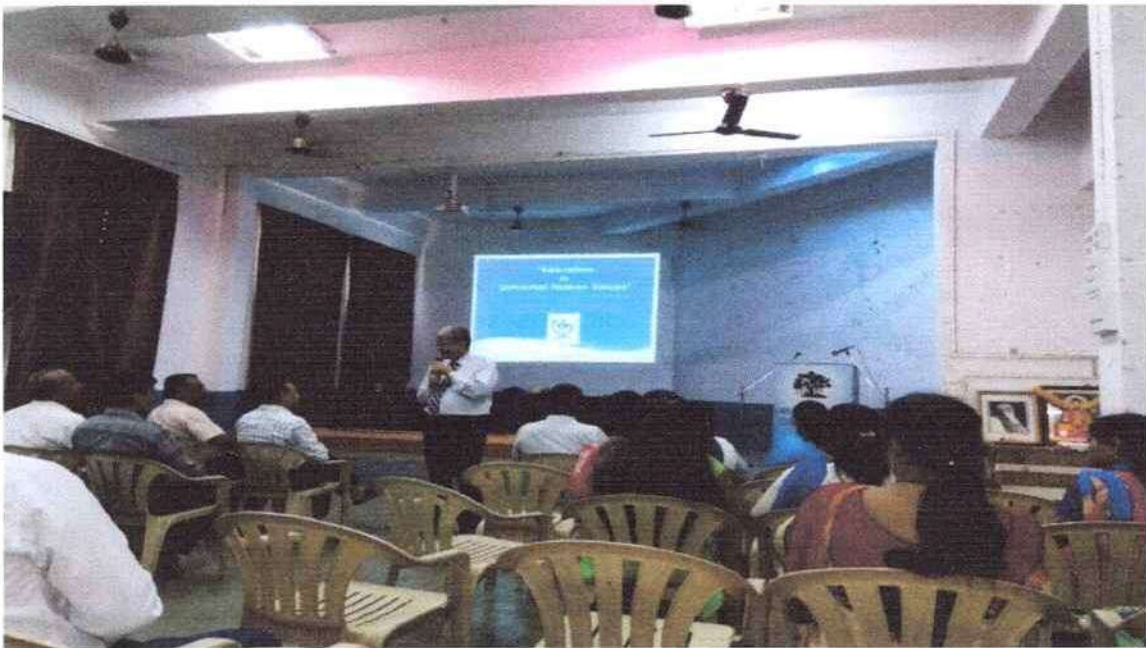
One Day Workshop on “Universal Human Values and Life Skills” On 30/04/2018