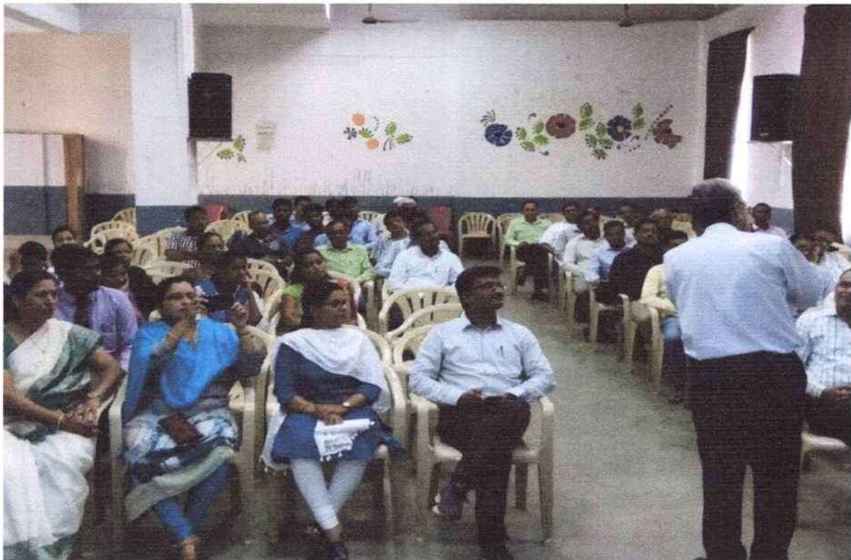
One Day Workshop on “Universal Human Values and Life Skills” On 30/04/2018