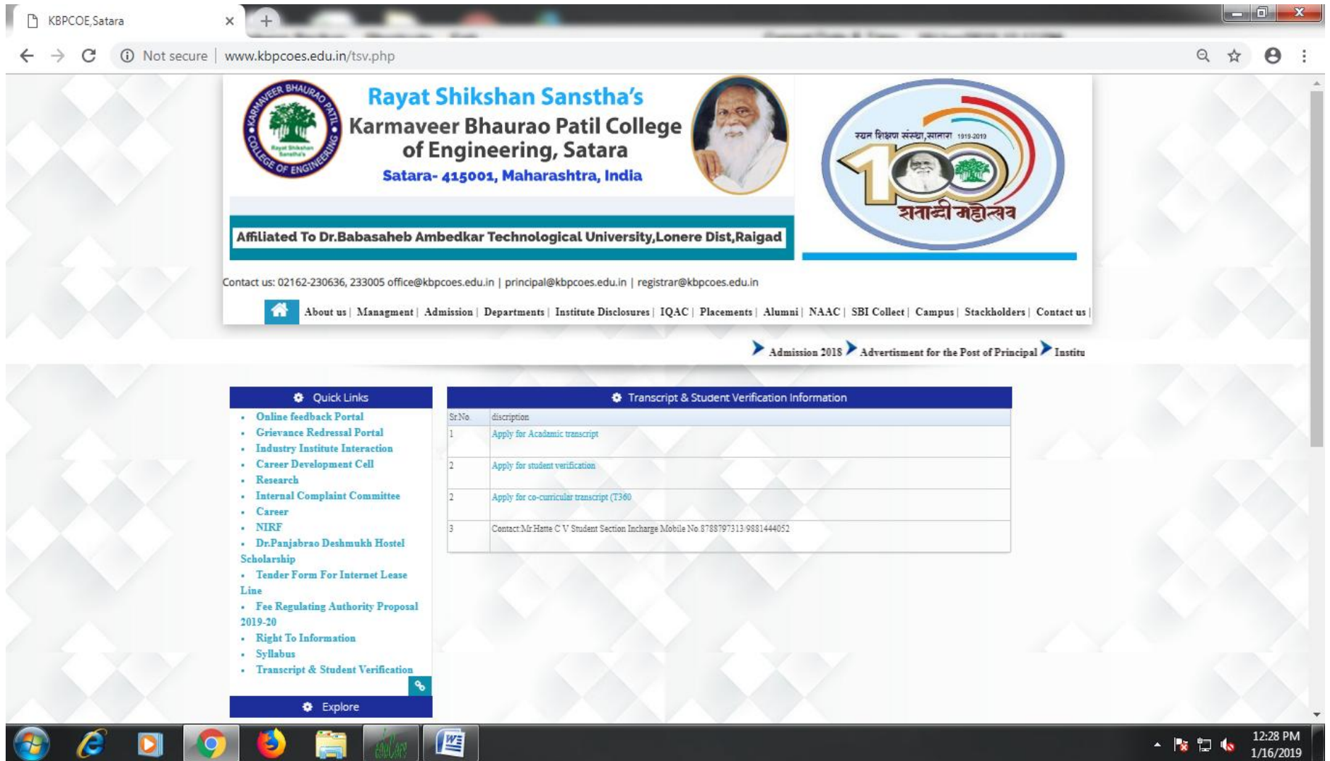
Karmaveer Bhaurao Patil College of Engineering, Satara: Institutes Website