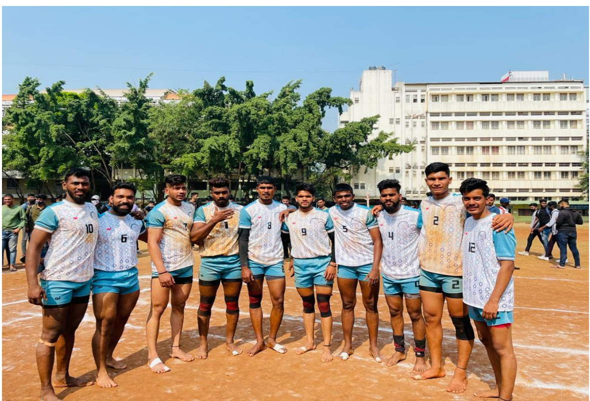
College Kabaddi Team